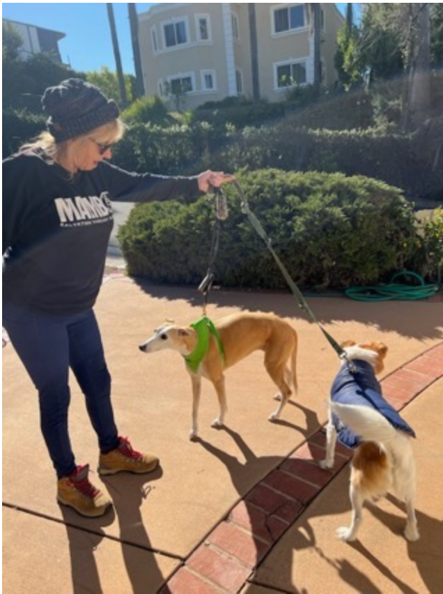
Photo from Nancy Schoenfeld of "Ella" (Kamio Sweet Taste Of Tangens, litter 2013) and friends.