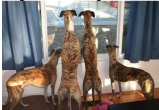
Protecting us from the neighbor's cat?