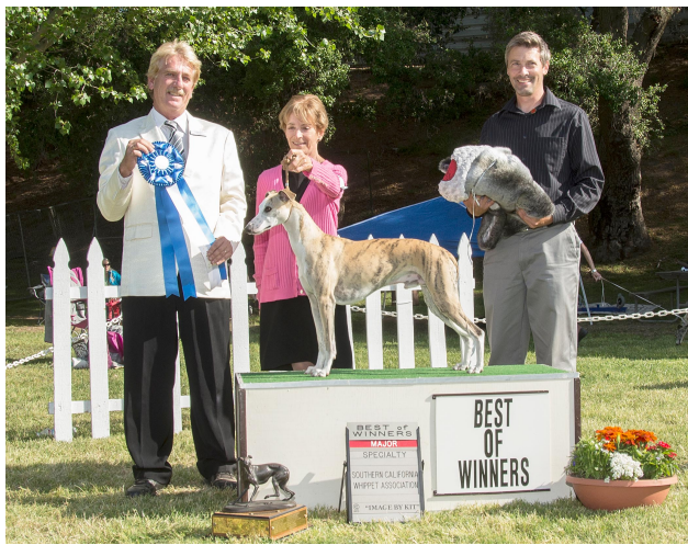
In the future, I may need to bring a step stool...