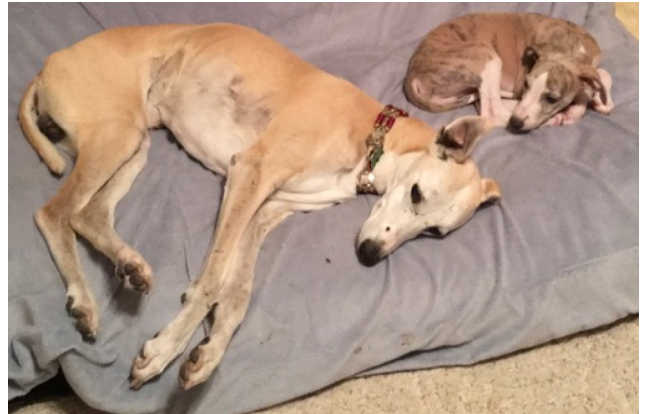
Photo is of Cowboy, a few weeks before he passed, with his Great grandson Spy. Cowboy was the sire of our litters 2004 and 2007. He was indeed a very special dog.

“I most likely would not clone one of my beloved girls. I might have considered cloning my Cowboy, but that ship has sailed. He was a very special boy! It is something to think about though. I would assume that this new cloned dog could not be registered with any club, like AKC. But I think this would be a fine thing to do if you simply cannot do without a beloved dog. Like Barbara Streisand has done. But she had a lot of money to spend. .. I say Good For Her!”