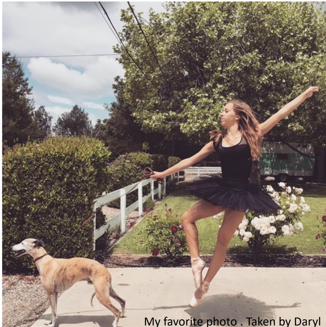
My favorite photo .