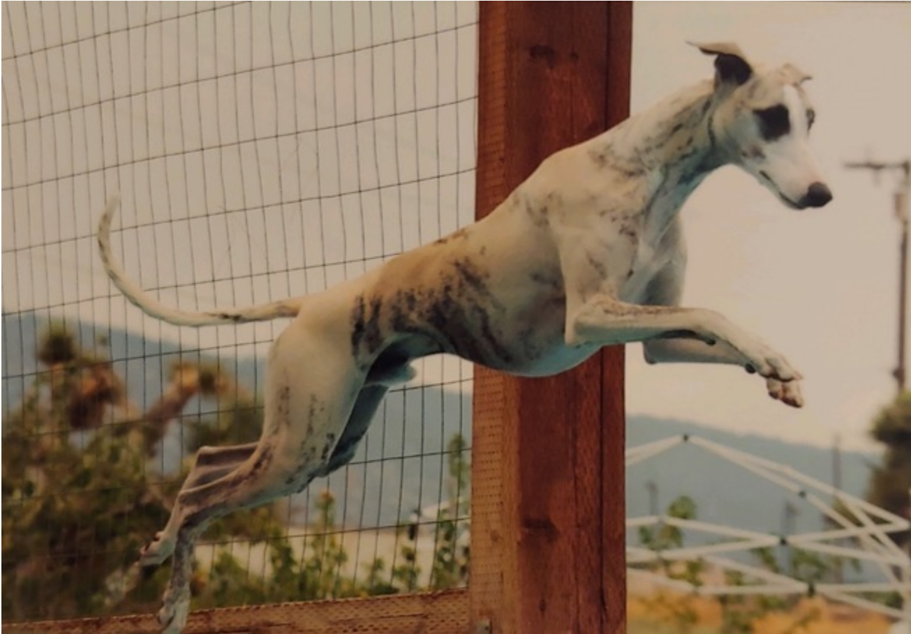
Sharon's whippet " Shadow " leaving the dock