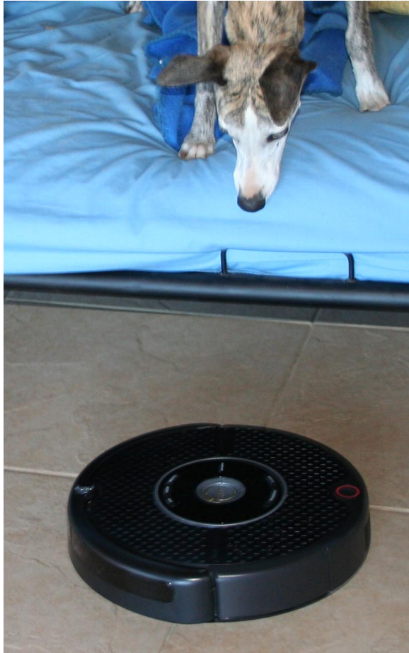
Laika watching the iRobot from the safety of the dogs' sofa.