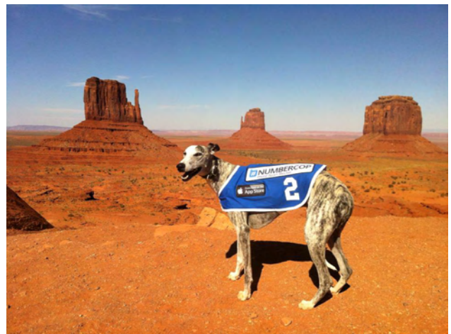
Prince in Monument Valley