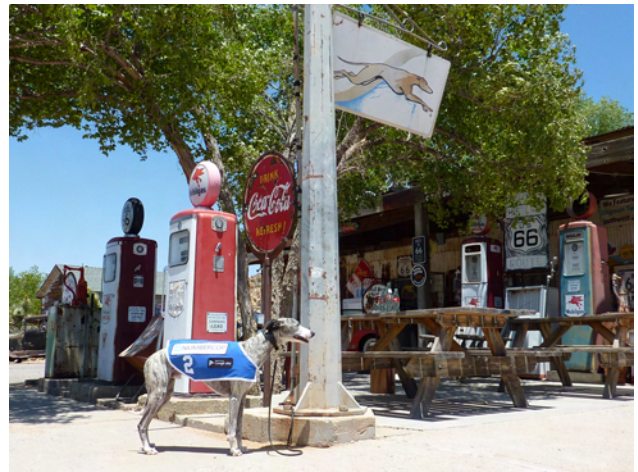
Prince at a Greyhound station along old Route 66

Wonder about Prince's coat? It is an ad promoting the owner's company.