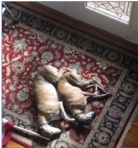
More siblings from the 2009 litter:

"As the weather is getting colder, one of the best places to be warm is laying in the sun at the front door!"