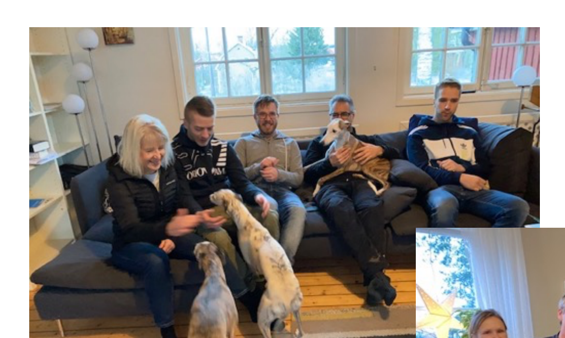
Reunited with family